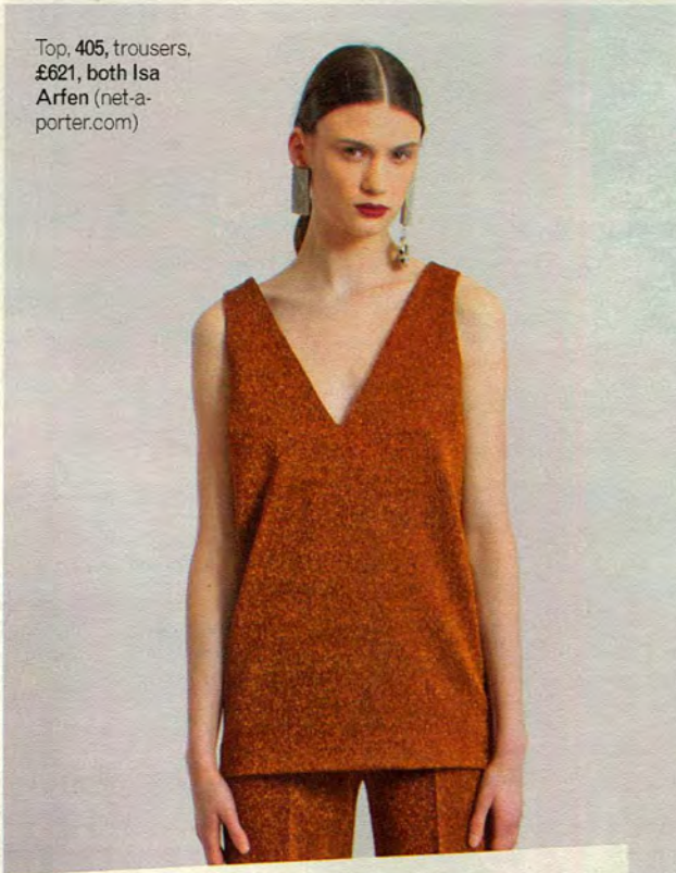
Top, 405, trousers, £621, both Isa Arfen (net-a-porter.com)