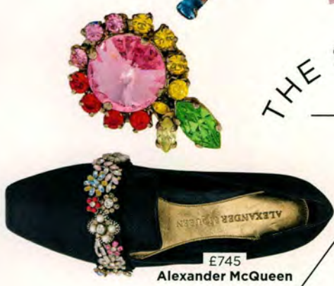
£745 Alexander McQueen

EMBELLISHED This season, shoes are the new jewellery. Not convinced? One look at CÉLINE's brooch-festooned heels or BOTTEGA VENETA's gem-adorned loafers and you'll be letting your footwear do the sparkling.