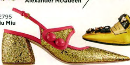
£795 Miu Miu