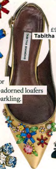
£995 Tabitha Simmons