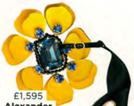
£1,595 Alexander McQueen