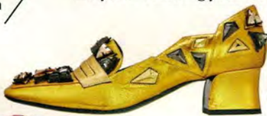
£1,335 Bottega Veneta