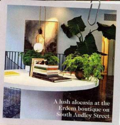
A lush alocasia at the Erdem boutique on South Audley Street